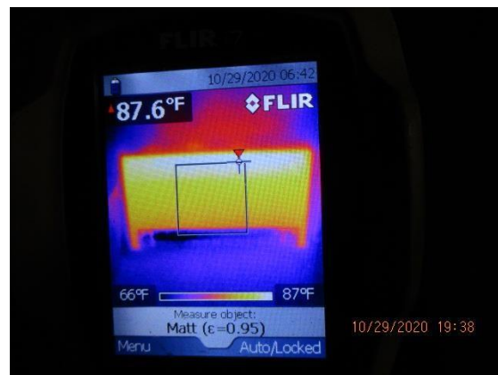
A hot water radiator.

For more related information click on this link: