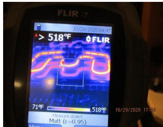
Heating elements in an oven.